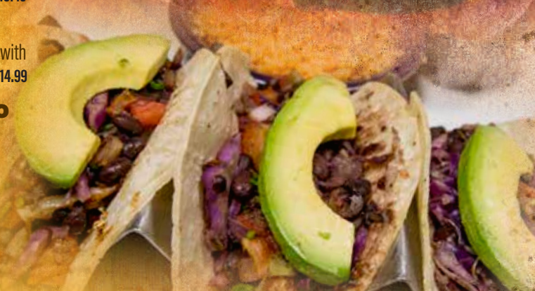
BLACK BEAN TACOS