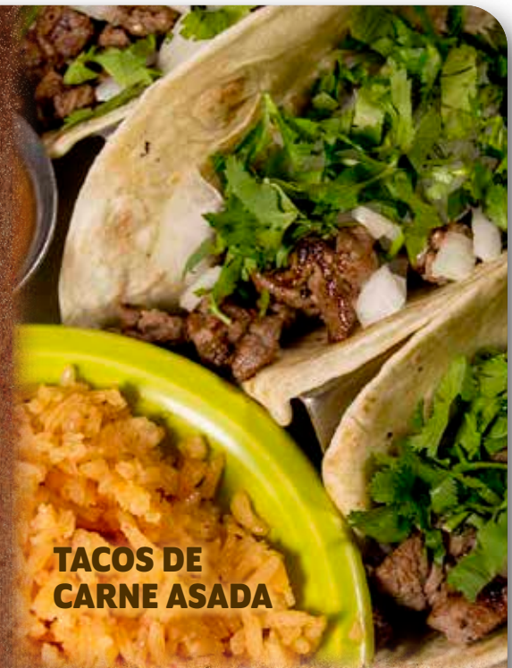
TACOS DE CARNE ASADA

Grilled ribeye, bacon, onions, jalapeño and topped with red sauce. Served with rice, beans and tortillas - 20.99